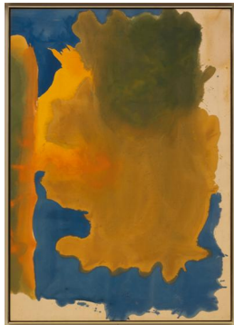
Helen Frankenthaler Canal, 1963 Acrylic on canvas, 205.7 x 146 cm Solomon R. Guggenheim Museum, New York, Purchased with the aid of funds from the National Endowment for the Arts, in Washington D.C., a Federal Agency; matching funds contributed by Evelyn Sharp, 76.2225 © Helen Frankenthaler

All press images (300 dpi) can be downloaded free of charge directly in the Internet at www.photo-files.de/guggenheim .